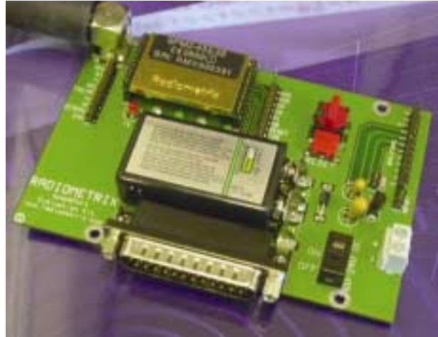
Figure 1: SP2-433-160 in SpacePort Eval Kit

SpacePort Evaluation Kit can be used to evaluate the Radiometrix SpacePort, Radio Packet Controller modules. LED indicators are provided to show system status and to facilitate range testing and installation site surveys. Internal EEPROM values can be configured through parallel port connection to PC using RPC Development Kit Software.